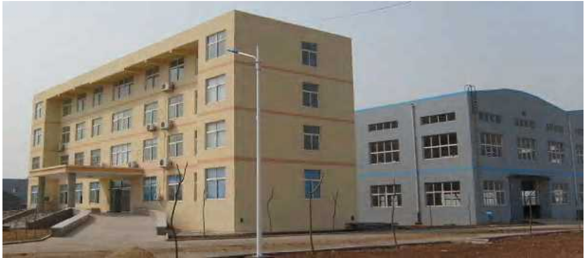
*. Out view of office and shop