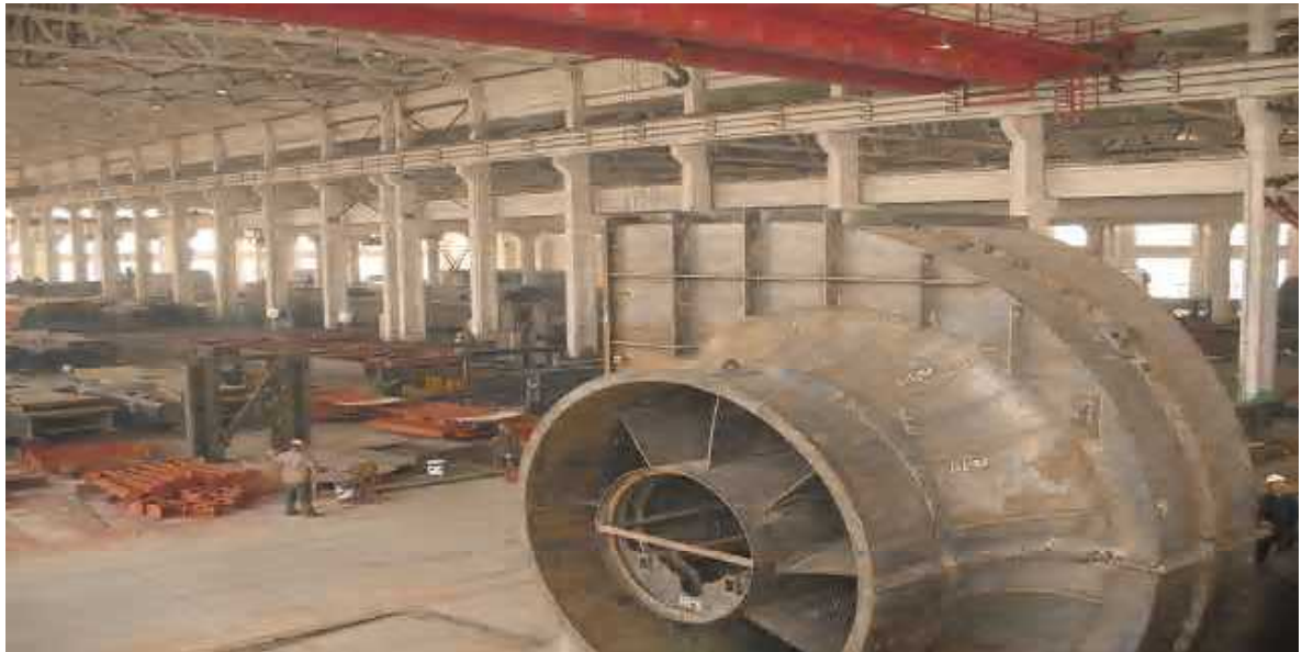
*.in-Shop view (shop 1)