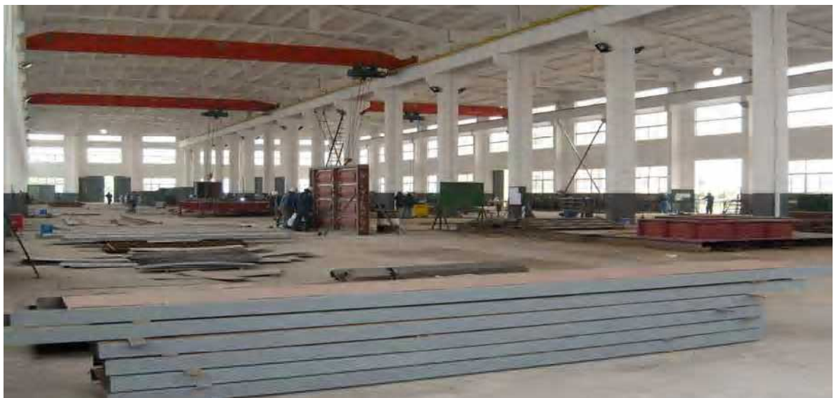
*.in-Shop view (new shop)