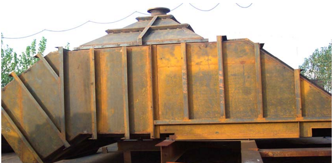
*. Gas Duct & Silo Assembly in Process