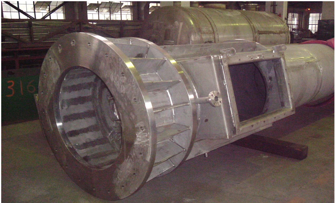
*. Stacks section for Incineration Plant (stainless steel)