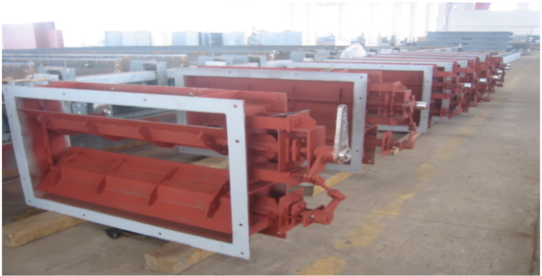
*. Gas Duct Damper of Power Plant in Assembly Process