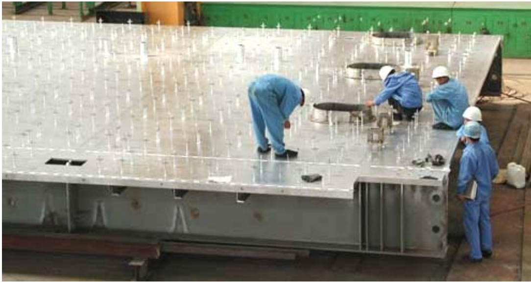
*. HRSG Non-pressure parts Fabrication (including Casing, Ducts, Stack, etc)