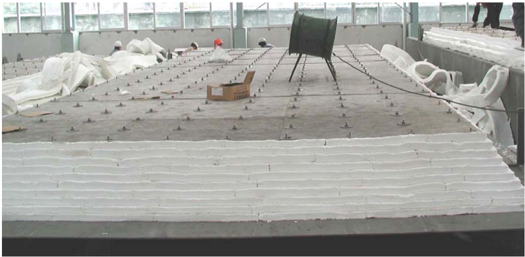
*. Insulation Application work. (Fiber Glass & Rock wool Felt, ect)