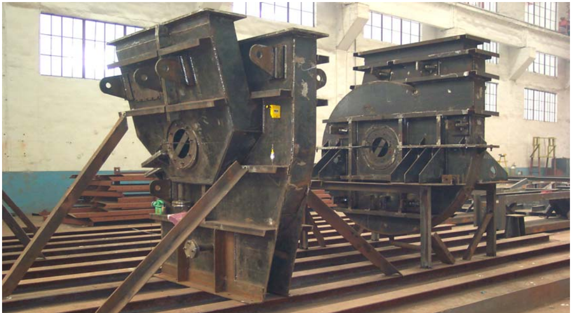
*. Fan Casing Final Assembly in Process