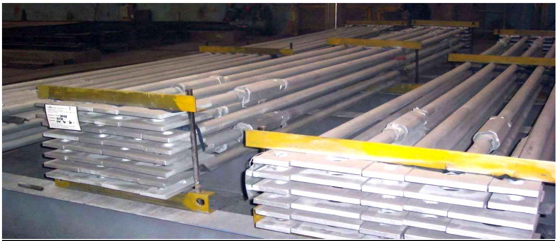
*. Hanger Rods Package of Boiler