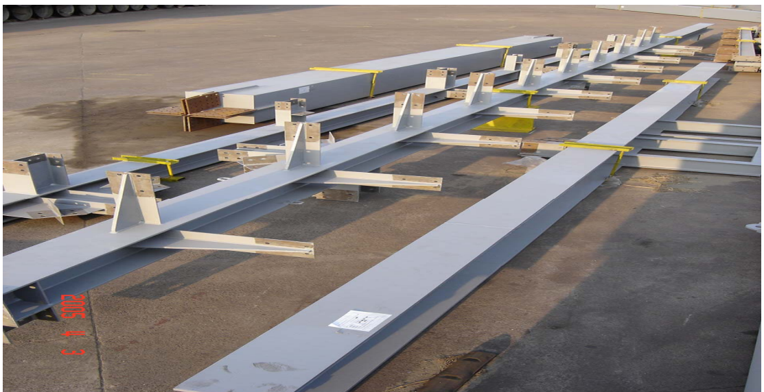
*. Steel Structures ;