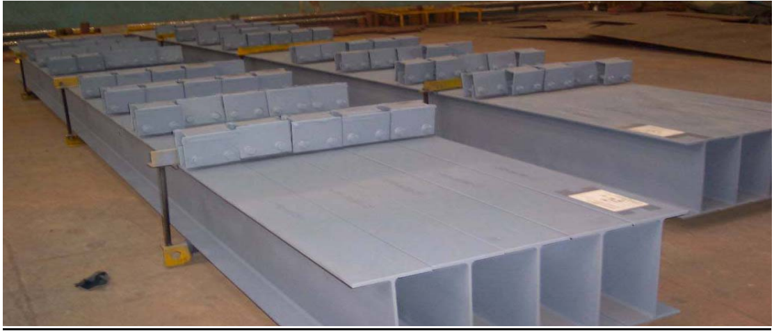
*. Backstay Package of Boiler