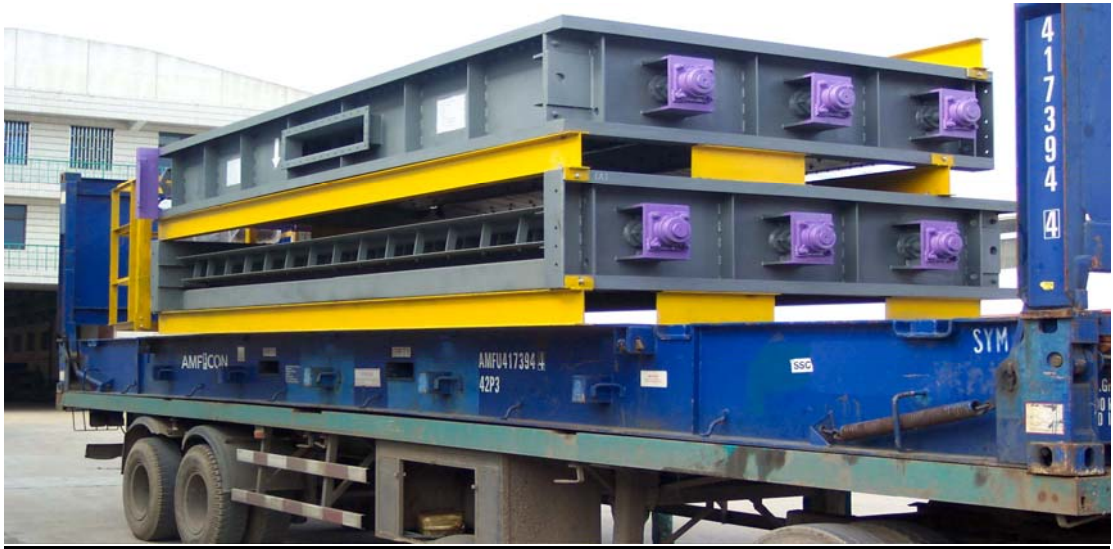
*. FGD Damper Delivery by Container