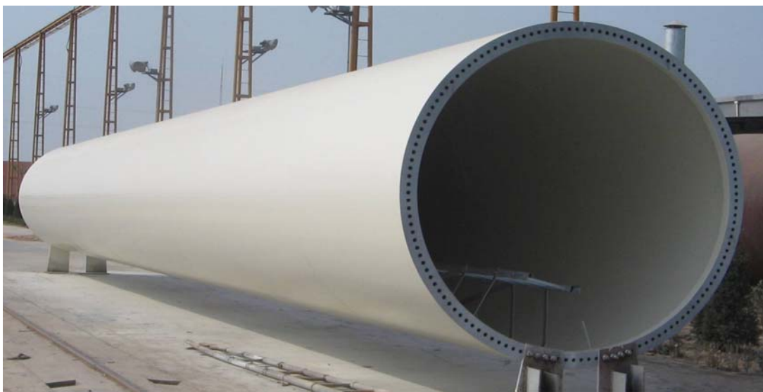
*.Wind Tower support for Wind Power Plant.