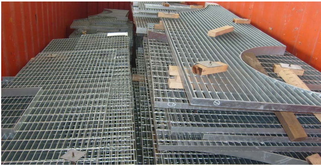
*. Gratings for Plant floor;