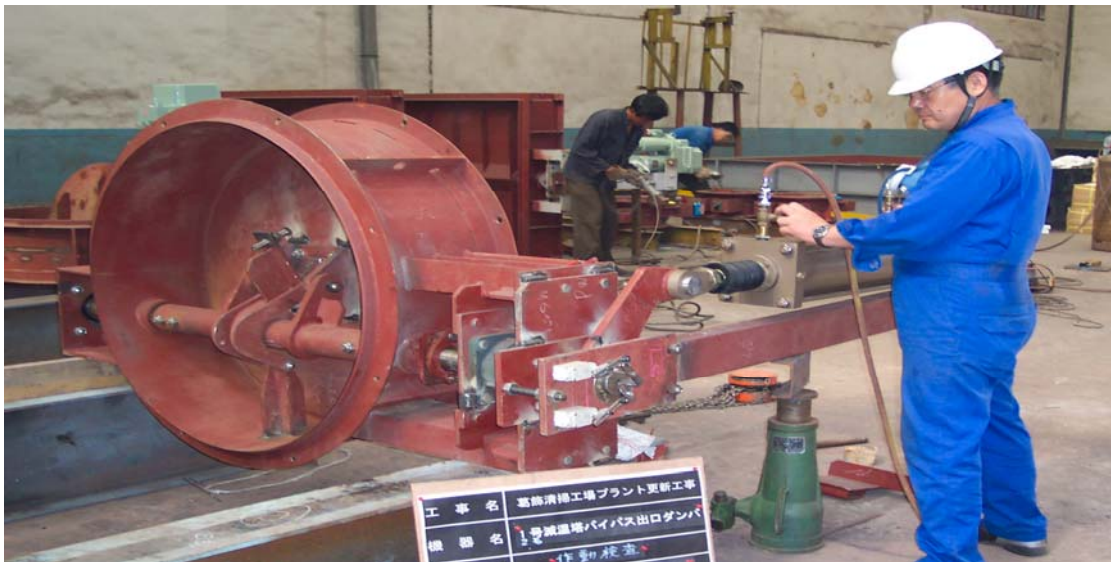
*. Damper under Testing and Commissioning