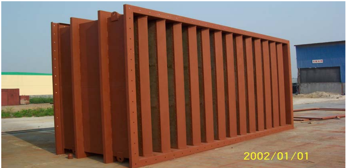
*. Fan's Silencer Module