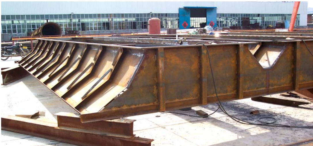
*. Outlet Duct Pre-assembly in Process