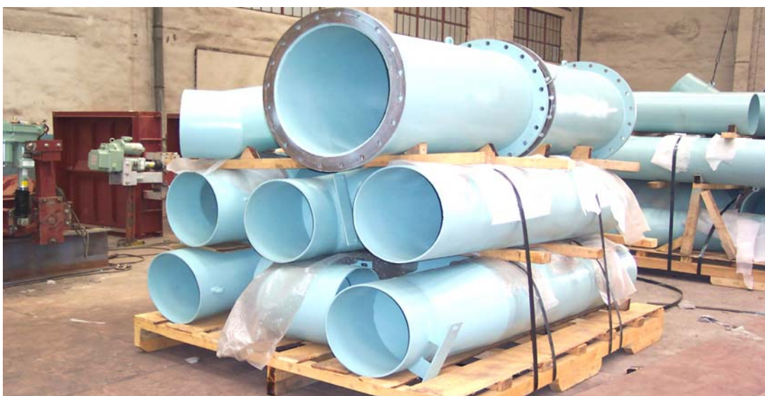
*. Ship Engine Ducts & Inlet Piping