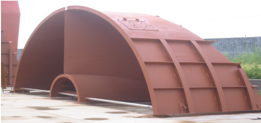
*. GGH Casing for FGD Plant