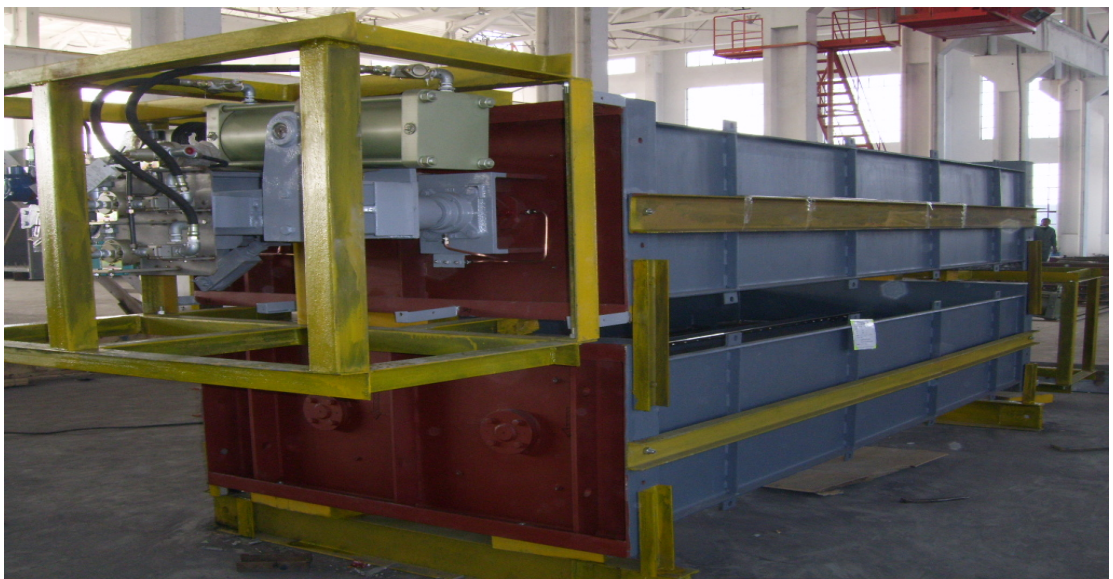
*. FGD Damper with cylinder packed for Delivery