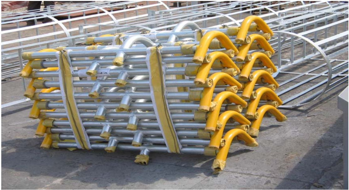
*. Handrail fabrication;