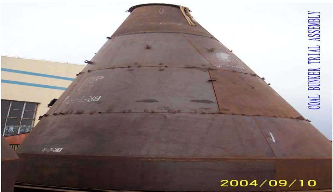
*. Coal Bunker Pre-assembly (Eccentric Bunker)